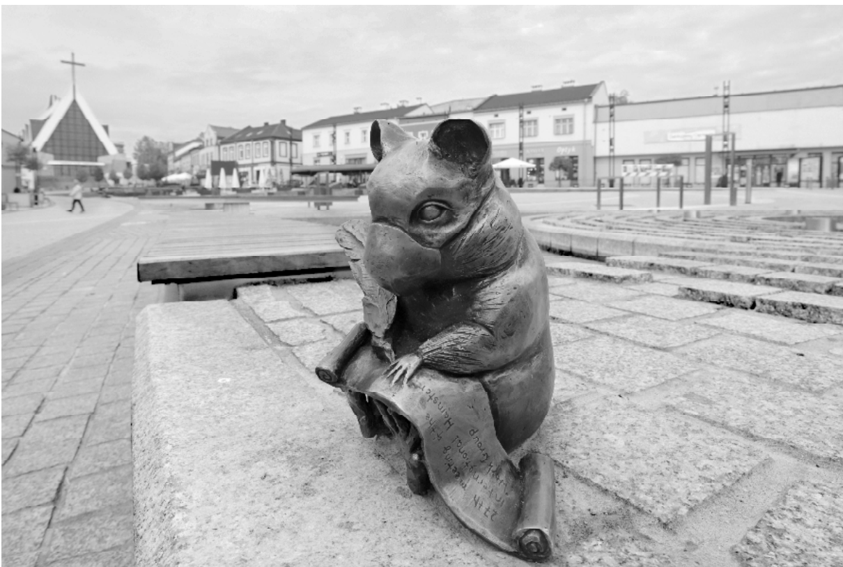
The unveiling of a bronze statue of a common hamster on the Jaworzno Market Square, to commemorate the 27 th Meeting of the International Hamster Workgroup (23.10.2020)